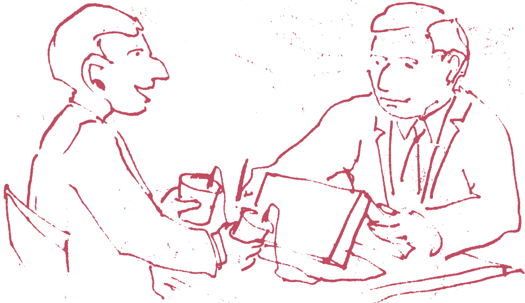
He'll help you a little.